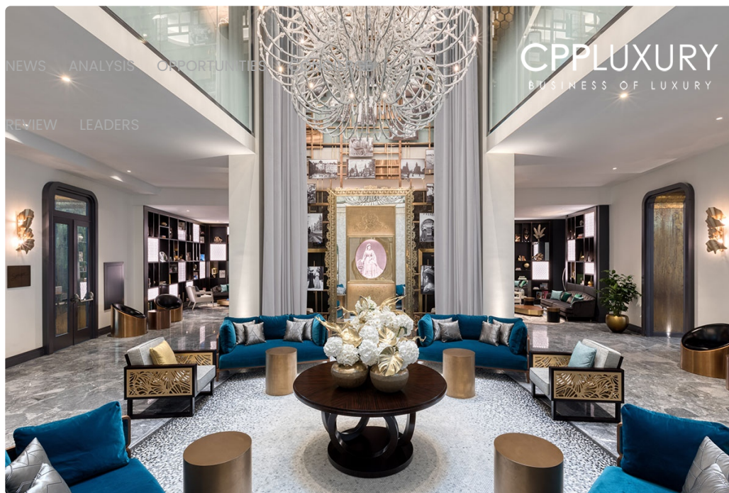
Matild Palace, Budapest, a Luxury Collection Hotel

Regal elegance is epitomised in the Maria Klotid Royal Suite, designed as a modern interpretation of the Duchess's private suite, featuring a spacious master bedroom, bathroom, living room and separate study, decorated with elegant chandeliers and handmade glass mosaics.