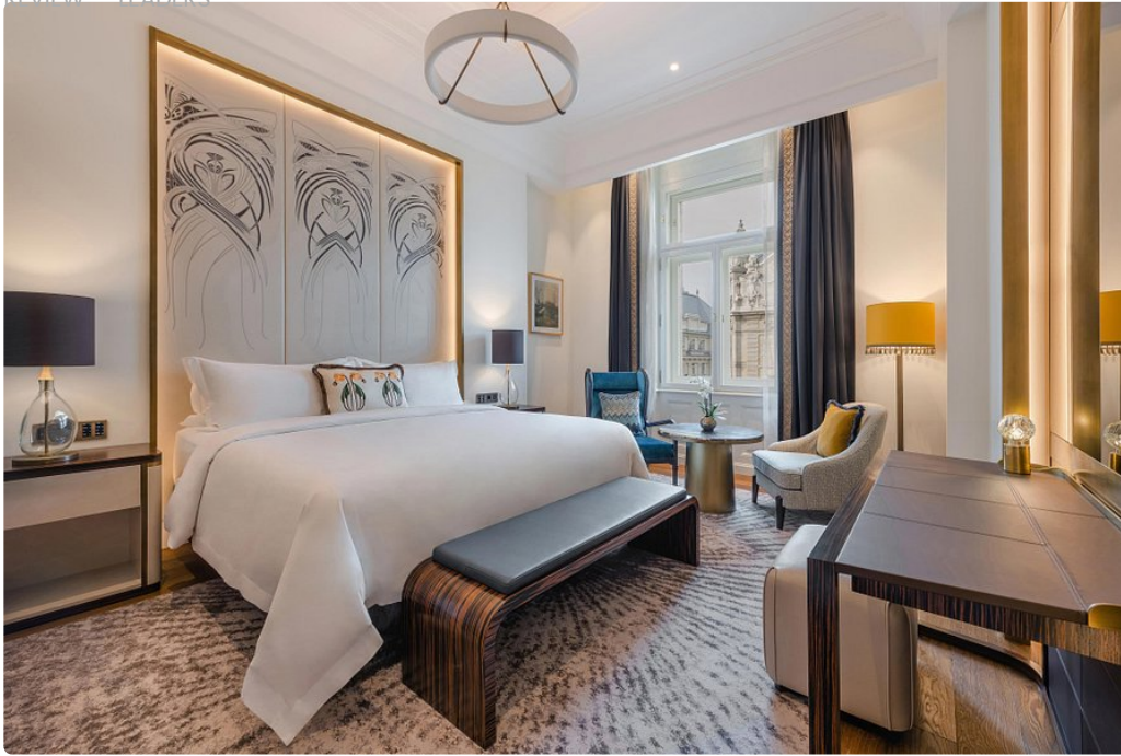
Matild Palace, Budapest, a Luxury Collection Hotel

Spago and Matild Café & Cabaret will both offer year round outdoor dining on the charming streets of Budapest, marking the first 'gastro street' in the city. Signature Guestrooms and Palatial Suites Matild Palace offers an exceptional choice of 111 elegantly appointed guestrooms and 19 suites, with many providing spectacular views of the city or the Danube River. The four guestroom categories each take inspiration from The Duchess's exuberant lifestyle and early 20th century Budapest.