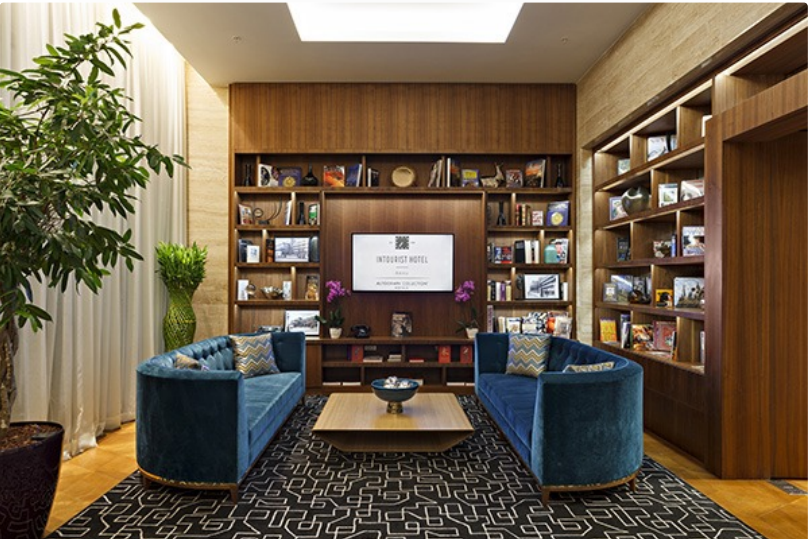
2 March 2016 MKV reveals designs for Intourist