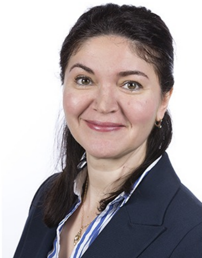
13 March 2017 Duravit names Projects Director