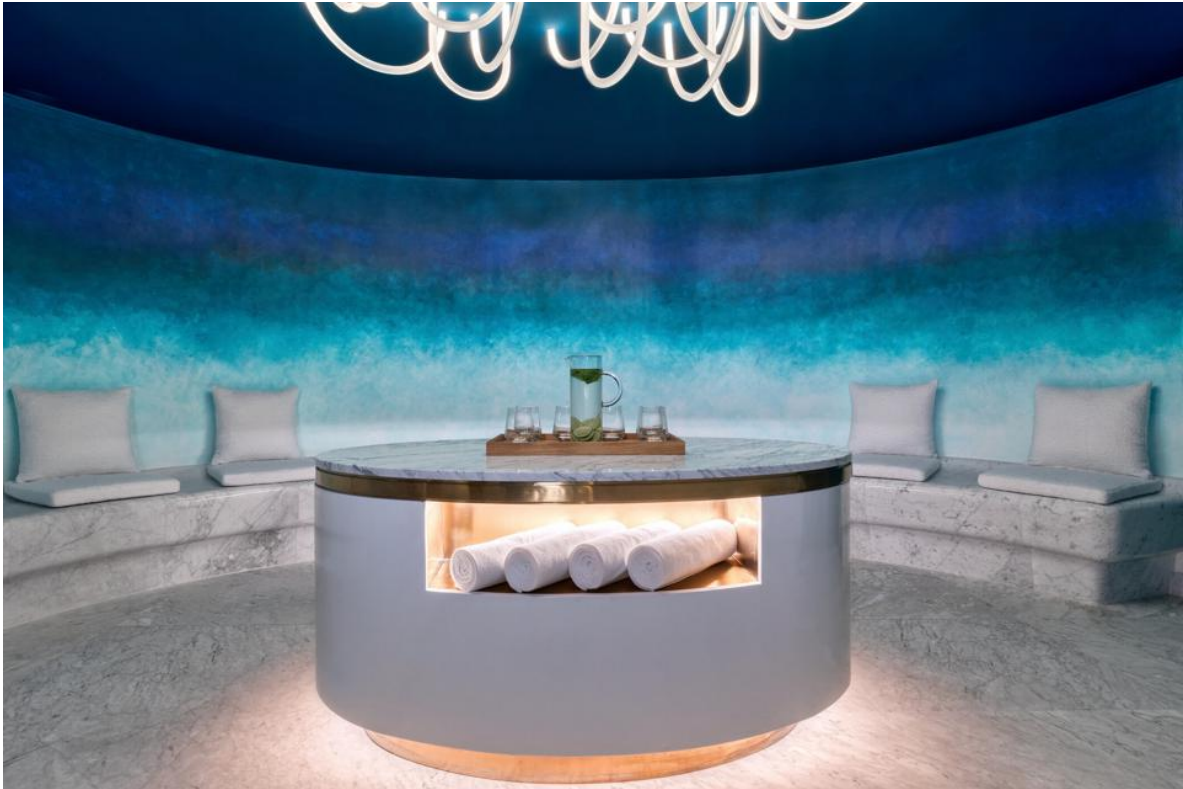
The Swan Spa at Matild Palace, a Luxury Collection Hotel, Budapest MATILD PALACE, A LUXURY COLLECTION HOTEL, BUDAPEST

Even more well known than the city’s café culture is its selection of thermal baths in historic buildings; a thermal ritual is an essential Budapest experience. The hotel’s Swan Spa , therefore, contains a thermal waters section along with a hammam and treatments. It isn’t as colorful/idiosyncratic as the public baths which draw a cross section of city residents but it is more refined and, in these COVID times, private.