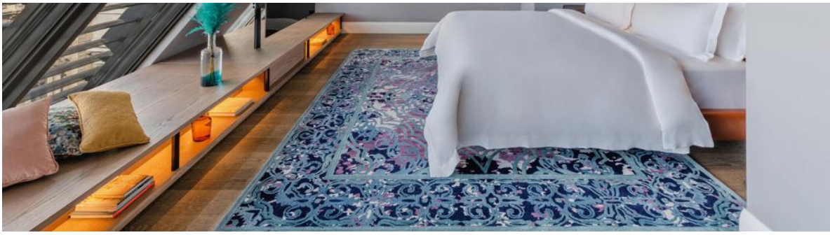
A King Loft Room at Matild Palace, a Luxury Collection Hotel, Budapest, a room that would have been ... [+] MATILD PALACE, A LUXURY COLLECTION HOTEL, BUDAPEST