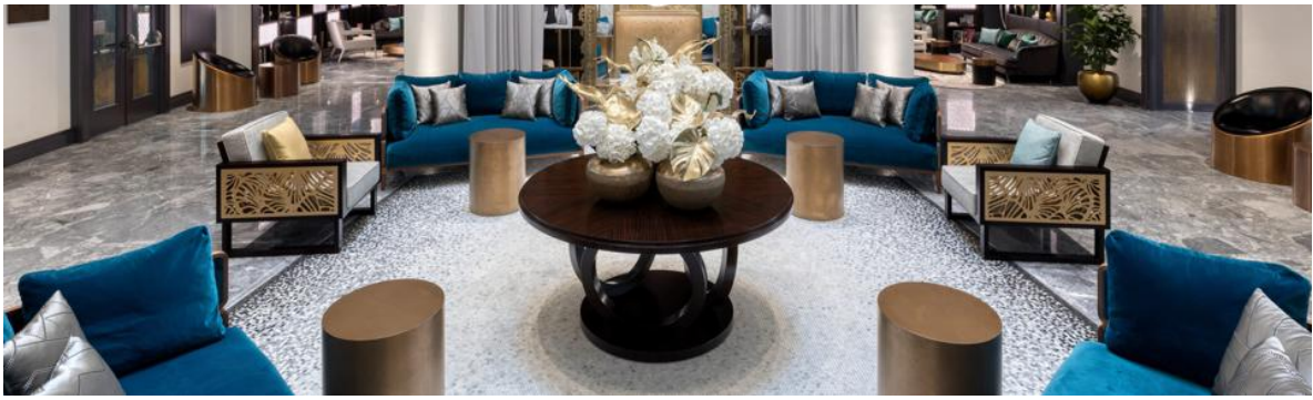
The lobby of Matild Palace, a Luxury Collection Hotel, Budapest MATILD PALACE, A LUXURY COLLECTION HOTEL, BUDAPEST

That historic/contemporary blend is carried over in the 111 rooms and 19 suites, many of which include fish bone design parquet floors, handcrafted headboards, high ceilings, views of the Danube and bathrooms tiled in gradient blue mosaic tiles punctuated with gold. Particularly special are the rooftop Loft Rooms with slanted windows, formerly the domains of Archduchess Maria's artistic friends, the 818 square foot duplex Crown Tower Suite within a 157 foot tall tower inspired by an Austrian archduke's crown affording 360 degree panoramic views of the Danube and the city and the Maria Klotild Royal Suite, expandable to a three bedroom 2906 square foot complex.