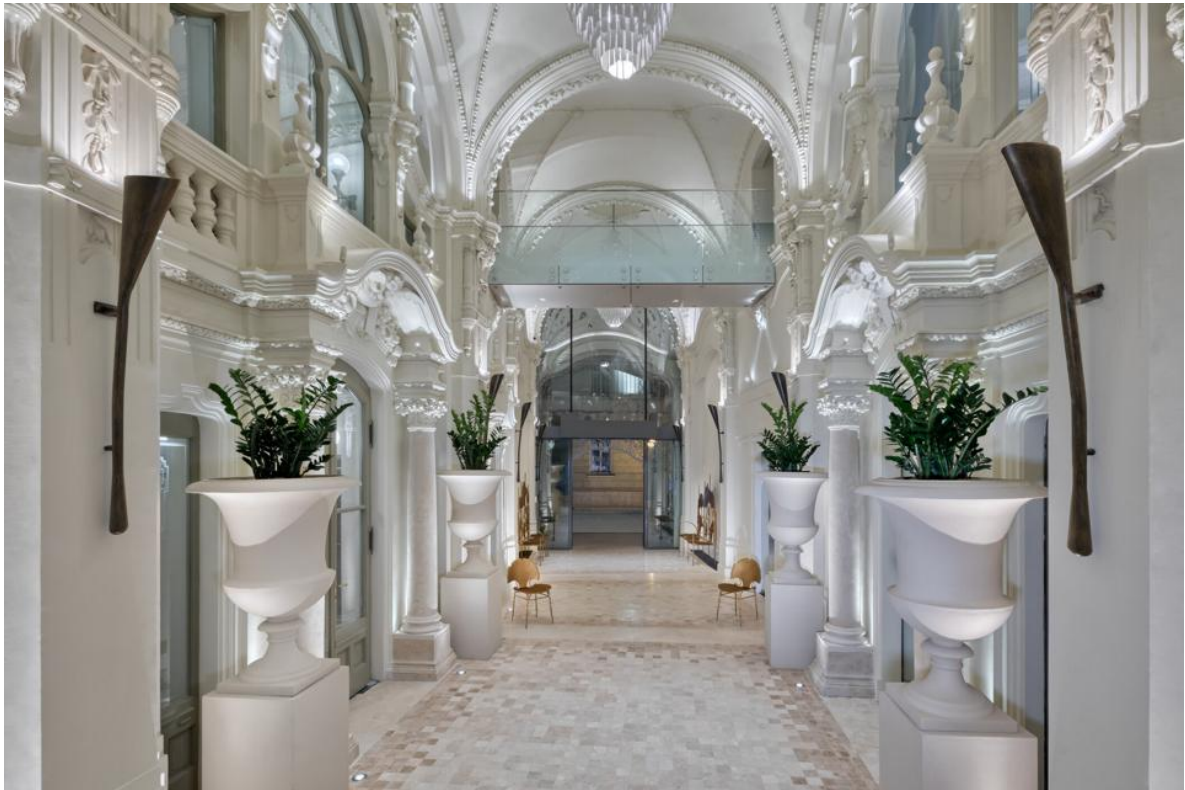
The restored historic passageway within Matild Palace, a Luxury Collection Hotel, Budapest MATILD PALACE, A LUXURY COLLECTION HOTEL, BUDAPEST

late June as the hotel Matild Palace, a Luxury Collection Hotel, Budapest , it aims to take that place in the Hungarian capital again.