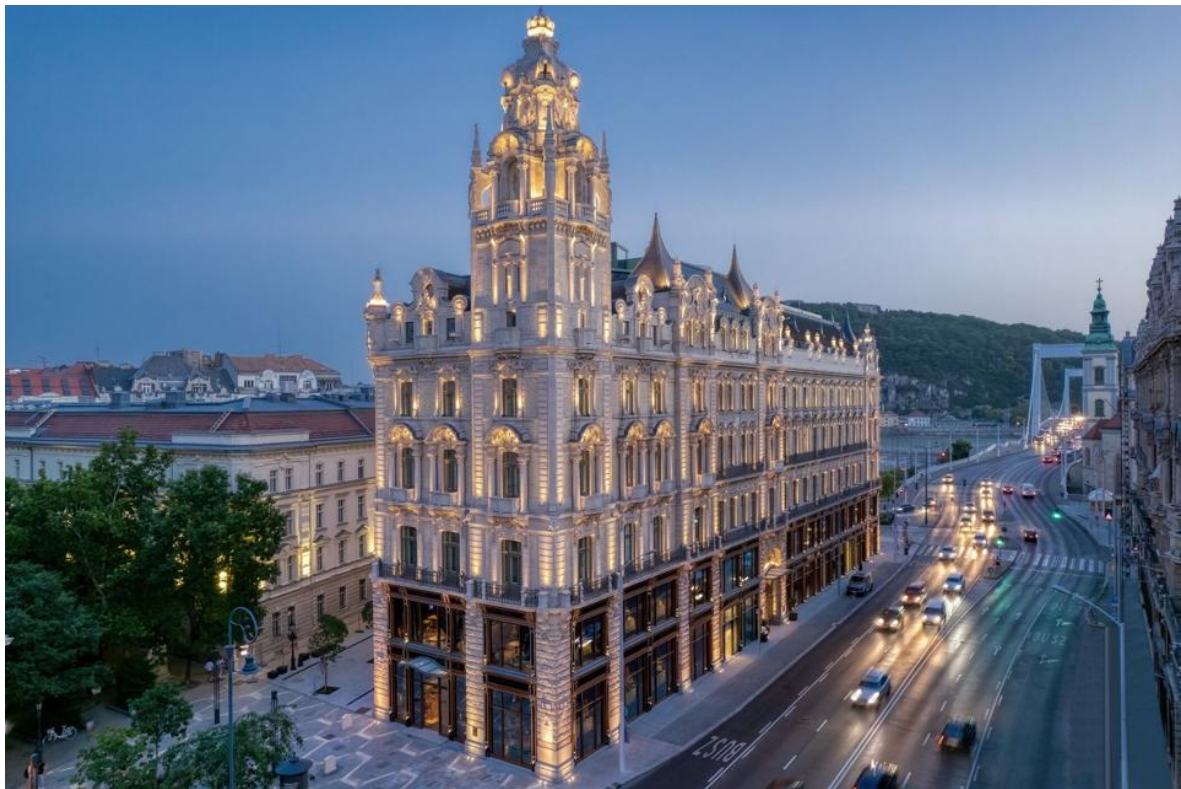
One of the two 1902 buildings that comprise Matild Palace, a Luxury Collection Hotel, Budapest MATILD PALACE, A LUXURY COLLECTION HOTEL, BUDAPEST