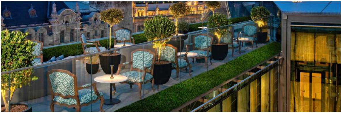
The view from The Duchess, the rooftop bar at Matild Palace, a Luxury Collection Hotel, Budapest MATILD PALACE, A LUXURY COLLECTION HOTEL, BUDAPEST

A deep knowledge of pastry will serve Puck well when the third dining spot opens in the hotel in mid-October. The Matild Café and Cabaret was formerly known as the Belvarosi Café, predating the palace by a year, serving as a gathering spot for the elite in the Belle Epoque era and then again as the first café to open after World War II. By day it will serve local pastries (which definitely hold their own with Viennese) and Central European classics. At night, the bilevel space will transition to a cabaret courtesy of a hydraulic elevated stage that was found during the building's renovation when a former employee came in to watch the work and casually advised them of its existence.