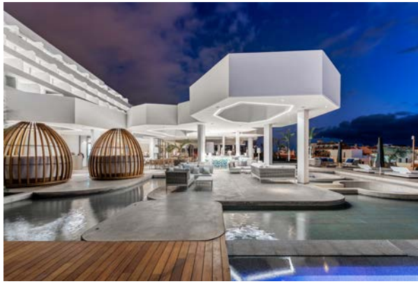
Photo: Royal Hideaway Corales Resort